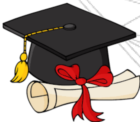
Learning Outcomes and Report Card

On seeking transfer from one institution to another, the previous school would deactivate his UDI link from the school portal and as soon as, he takes admission in the successive institution, his UDI number would again activate and start fetching information from the later school. This is how a candidate would never be able to take admission in two institutions at one time.