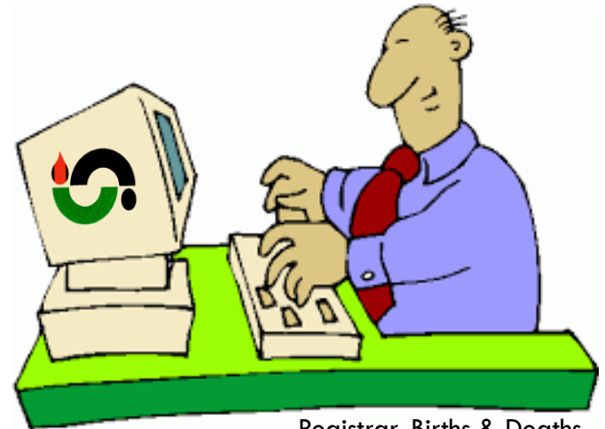
Registrar, Births & Deaths

GI Card with SIM Carrying your UDI number